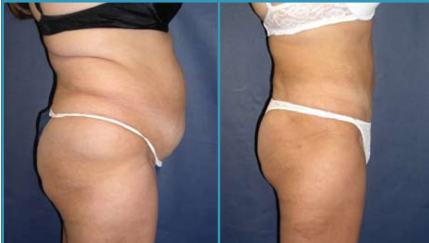
Before (Left) and After Abdomen Treatment (Right).

through the skin ports which are either screwed or sutured to the inside of the incised access sites.