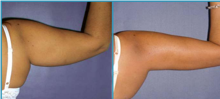
Before (Left) and After Upper Arm Treatment (Right).