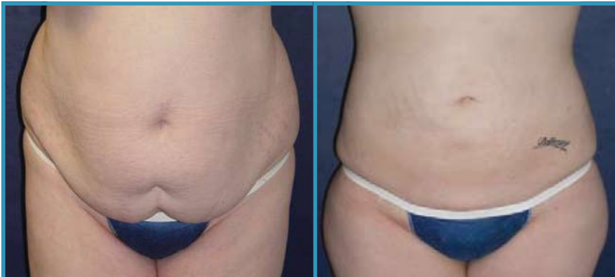
Before (Left) and After Abdominoplasty Treatment (Right).

Because of the ability to switch probes to match tough fibrous tissue type, efficient treatment of both excess fat and redundant skin can be performed, leading to excellent contour shaping without skin resection. For similar reasons, the abdomen also responds favorably to these qualities and may permit the surgeon to avoid a horizontal